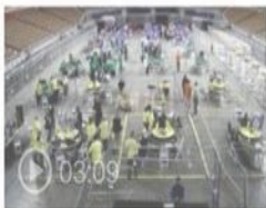
Arizona GOP's desperate attempt to prove election fraud sparks outcry