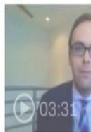
Why the GOP beef with Biden plan