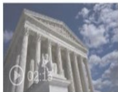
Supreme Court set to take up major Second Amendment case